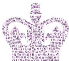
The Queen's Award for Voluntary Service

Are you a volunteer group that deserves recognition for your outstanding work or would you like to nominate another group to receive an award?